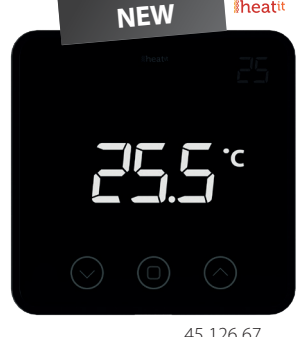
HEATIT Z-TEMP2 White RAI 9003